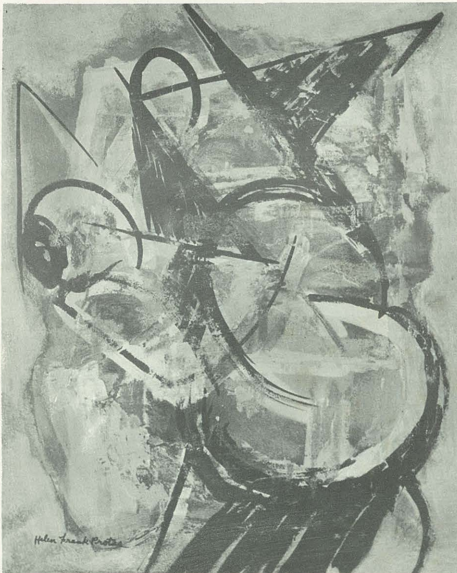
INSPIRATION - NATURE