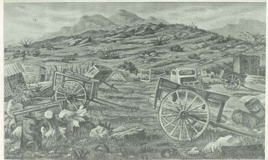
THE YELLOW CART