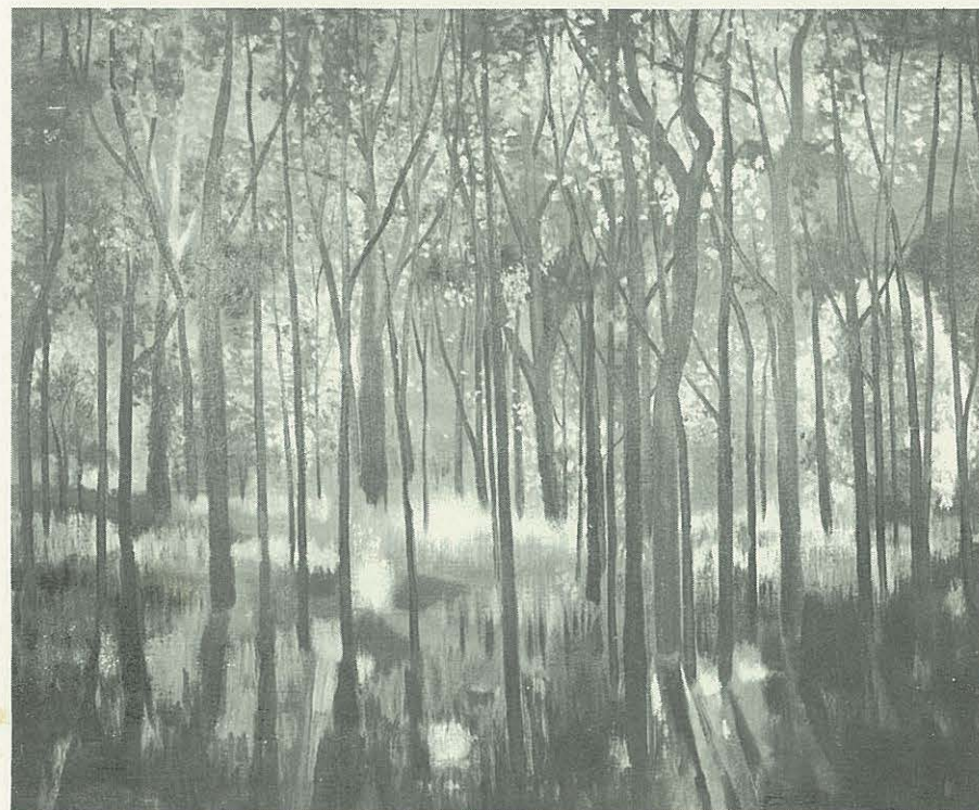
FOREST Elden Rowland (oil)