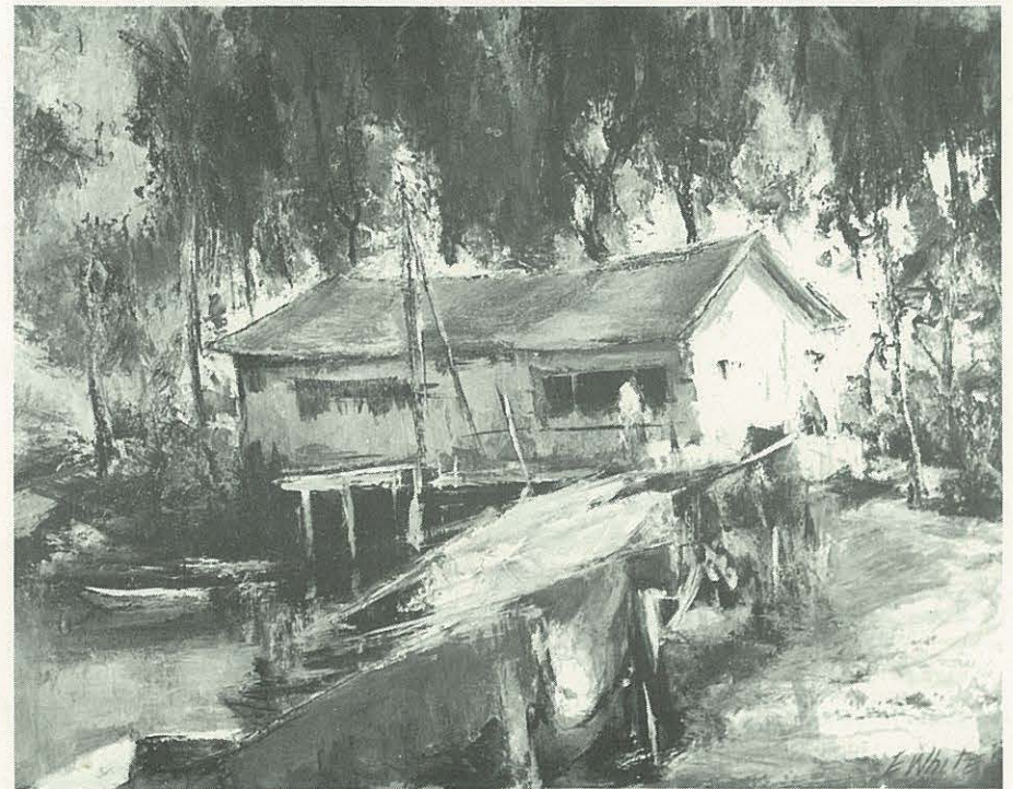
BENEATH THE PINES