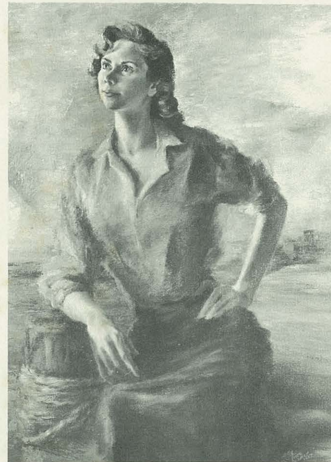
SEARCHING THE WIND