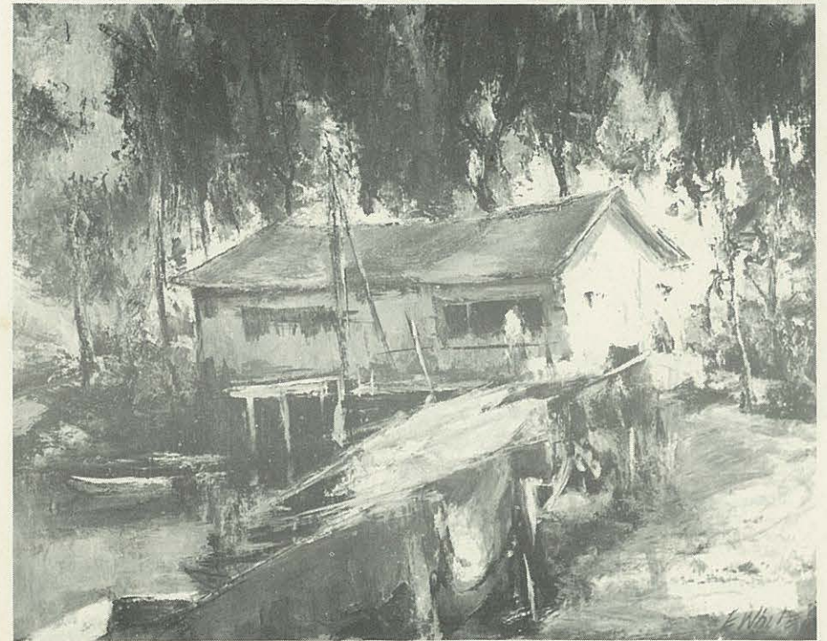
BENEATH THE PINES