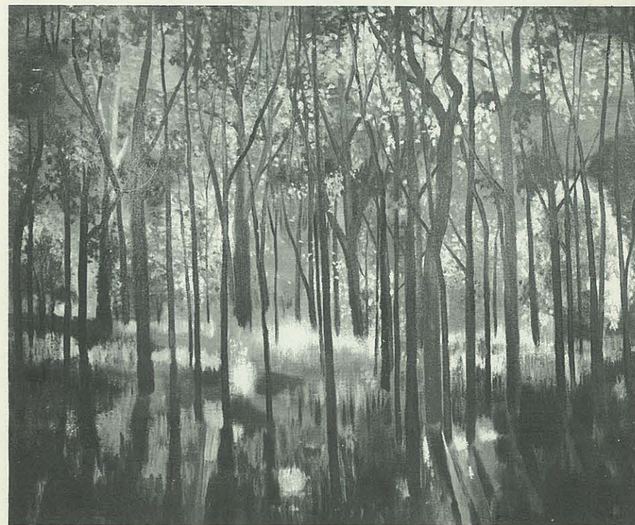
FOREST Elden Rowland (oil)