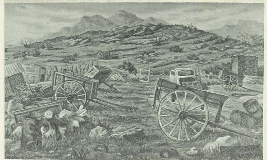
THE YELLOW CART