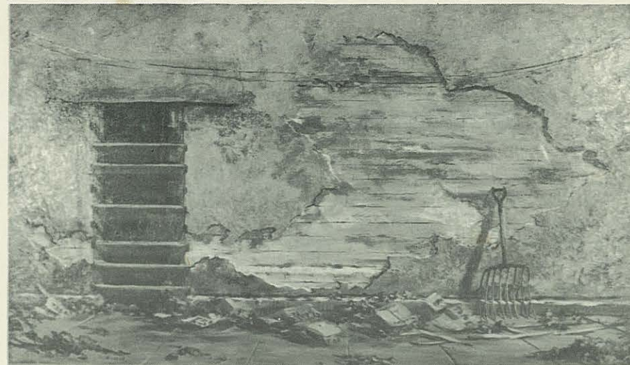
BIN NO. 1