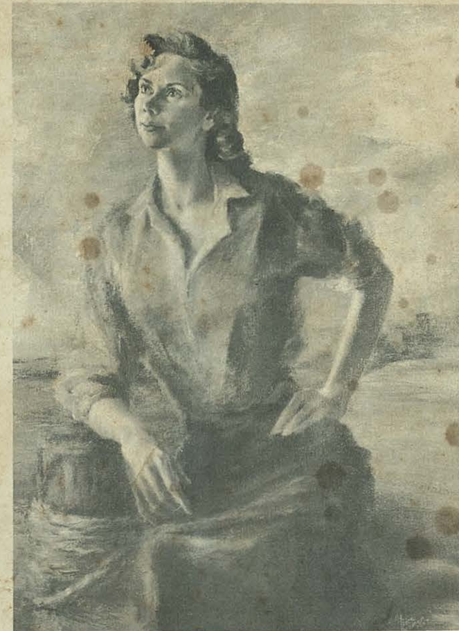
SEARCHING THE WIND