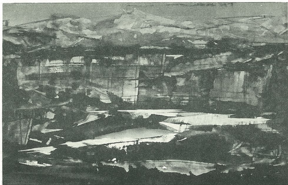
"Canyon" Robert Chase Watercolor $350