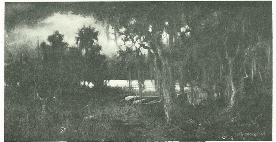
"Waterfront Property" Roy Nichols Oil $500