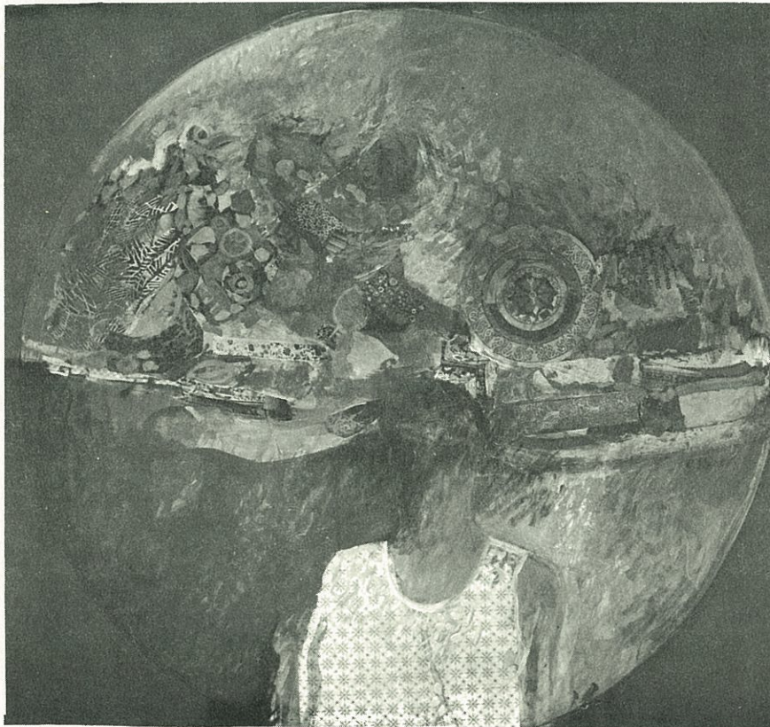
"Figure-Landscape" Gretchen Ebersol Acrylic Collage $100