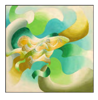
Green Gold Cecily Hangen

Cecily Hangen 's painting Green Gold was juried into the Palm Beach Cultural Council County Contemporary exhibition running from June to September 2013.